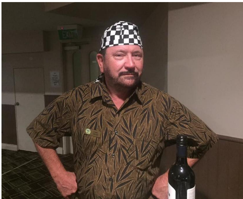
Catering awards were given and one of our newest members had more than one special mention. A great night was had by everyone.