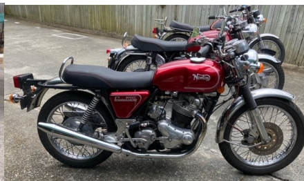
1973 Mk II