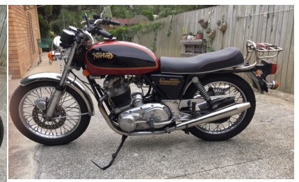
1975 Mk III

As most of you know, the doctor has taken my motorcycle license away, so I get to only look at my Nortons.